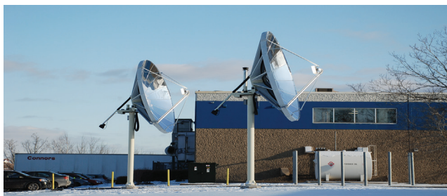
Location: Nova Scotia, Canada Application: Process Heating at Bottling Plant